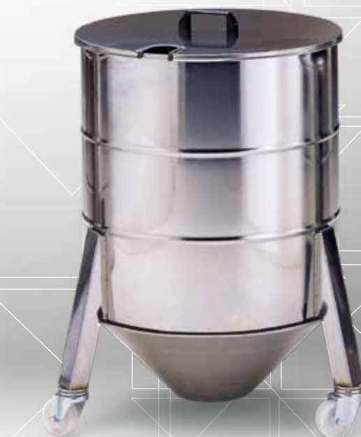
Recipientes en acero inox para el almacenamiento del material.