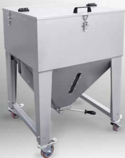
Stainless steel bin for material storage.

Fusti in acciaio inox per stoccaggio materiale.